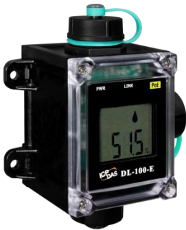
DL-100-E or DL-100-E-W

In addition to this guide, the package includes the following items: