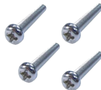
M4 x 30L Screw * 4