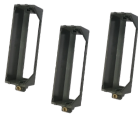
I/O Socket * 3