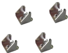
Panel clip * 4