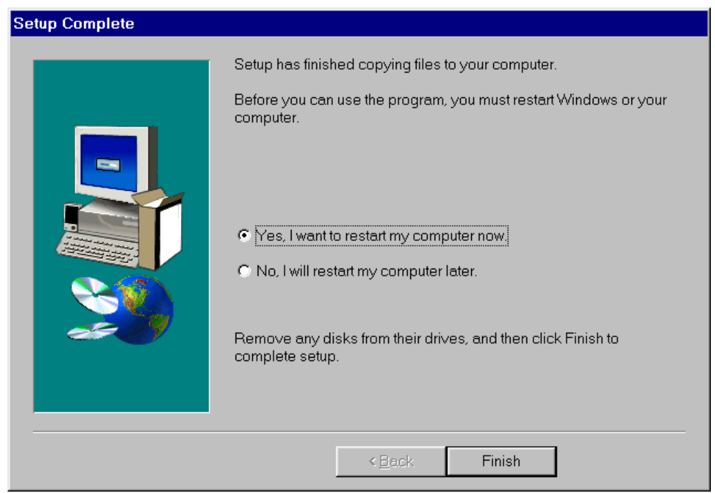
Figure 4. Select the item "Yes, I want to restart my computer now" and click the button "Finish" to restart the user's system.

Figure 3. Click "Browse…" to change the folder that the user wants to install and then click "Next >". This folder will contain the software for the DAQ card.