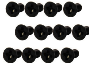
M3 x 6 螺絲 x 12